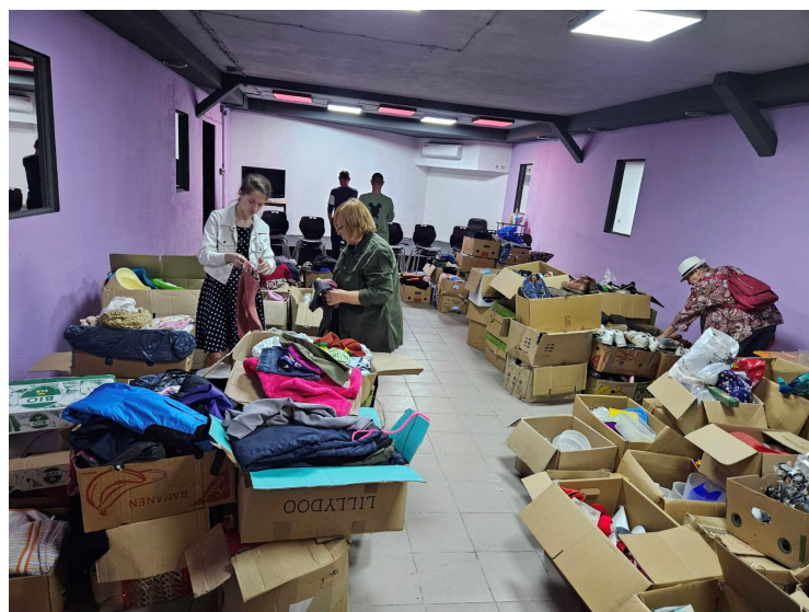
Street feeding and the recently opened Community Hub

'To the needy in distress, you are a shelter from the rain and the heat.'