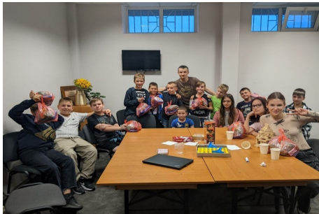
The photographs show: 'Teen Club'; care for the elderly and 'victory bread'

Poltava is a city of around 300,000 people situated around 75 miles from the border with Russia, and roughly 143 miles from the eastern front. Regarded as 'safe' until 2024, the city and surrounding region are now regular targets of Russian drone and missile attacks. On September 3rd, Russian forces launched two ballistic missiles against the city and a total of 58 people were killed and over 320 were injured. A team from the church immediately went to one of the city's hospitals to provide care to the victims. Our partner, Serhii writes: 'We saw the strength of spirit and courage of those who, despite trauma, remained steadfast and hopeful. Doctors have selflessly fought for every life, and we were honoured to help them by providing necessary medicines, bandages and nutrition to the patients.' In the month of September, Salvation Church ran 24 support groups for IDPs at the church for Bible study and food parcels (250 people approx.) and visited 80 wounded soldiers. They also, with the full-time army chaplain, visited 150 soldiers on the front lines. As well as praying with the soldiers they took some pastries, 'victory bread', biblical literature and personal messages of support and hope.