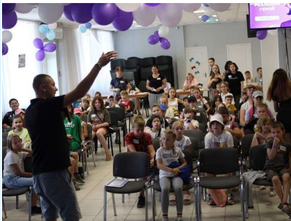
The long-awaited children's camps for children aged 6 - 12.