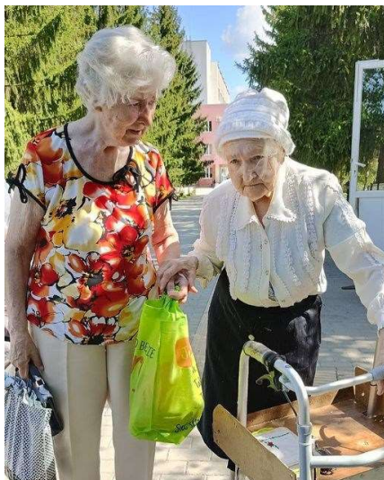
Above: A volunteer caring for the elderly (Salvation Baptist Church, Poltava)