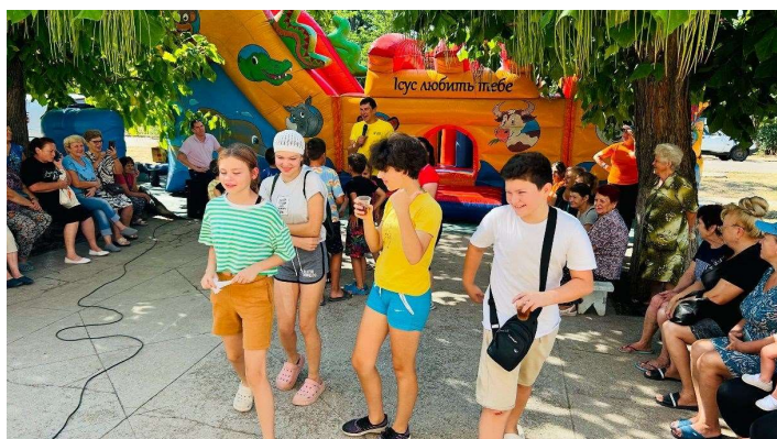
Fun and games for children living near the frontlines - Kherson

...they are plans for good and not for disaster, to give you a future and a hope.' Jeremiah 29.11