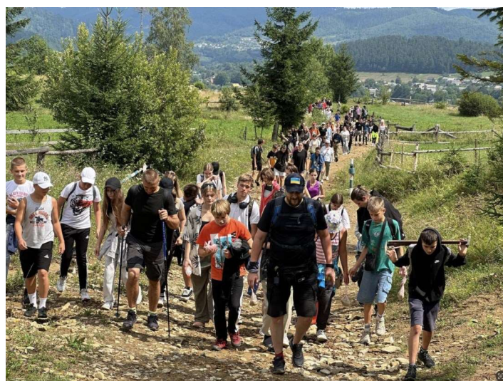
The six-day camp for internally displaced teenagers.