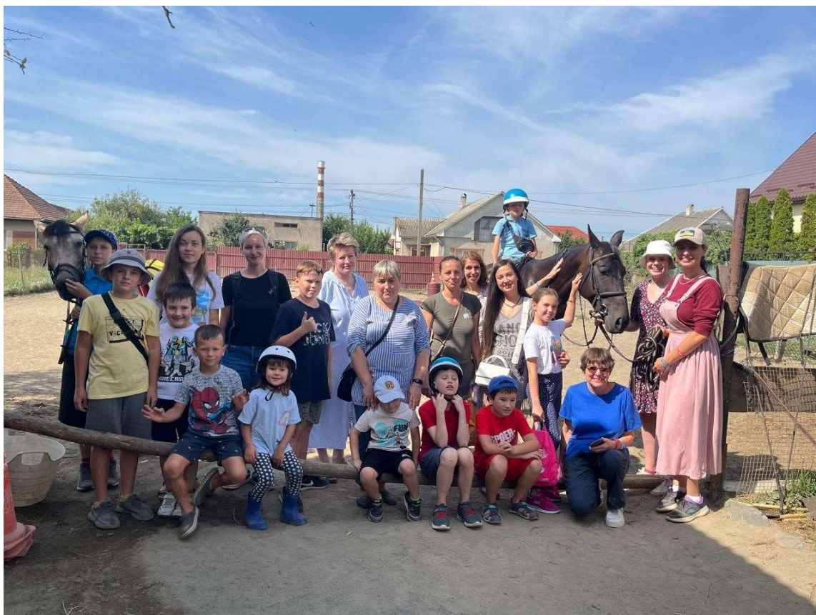
Internally displaced children and their parents on a 10-day summer camp run by the Equilibrium Project in Uzhhorod, Western Ukraine.

It has been a summer of smiles for children taking part in DHM's camps. Our partners have given children and young people a break from the war and time to experience joy, hope and positivity.