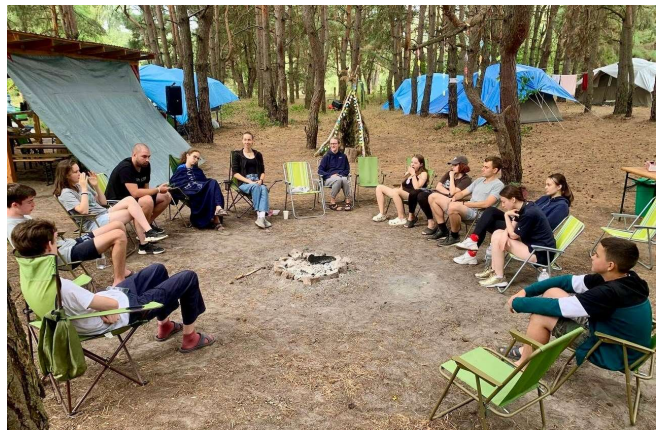
Teen summer camp 'unforgettable adventures and spiritual enrichment.'